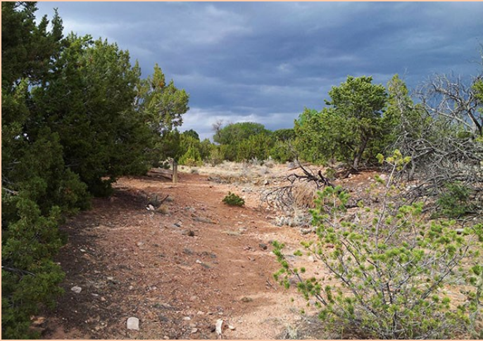
Santa Fe Trail Ruts