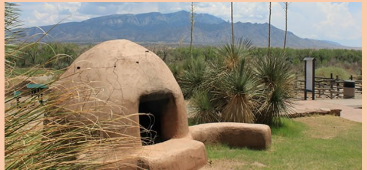
Coronado Historic Site