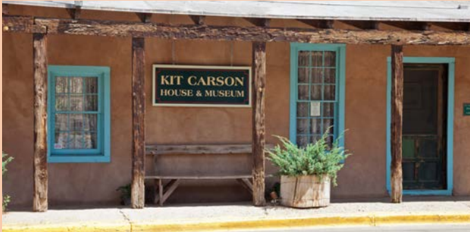
Kit Carson House, Taos