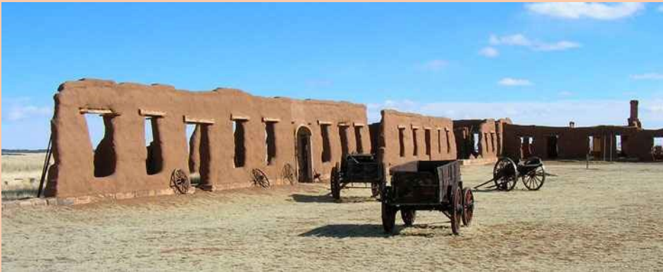
Fort Union National Monument