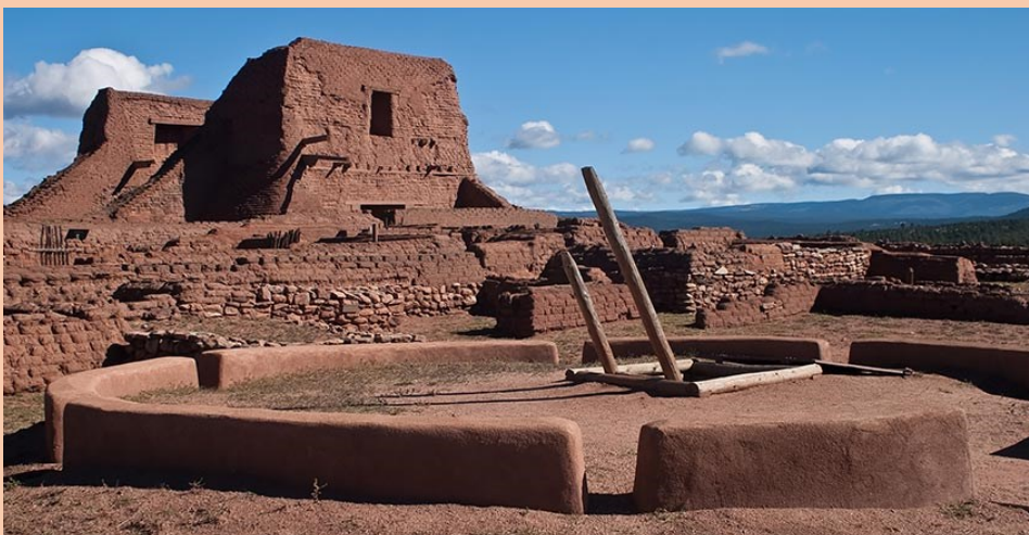
Pecos National Historical Park