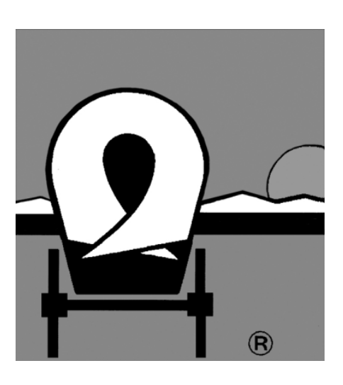
OCTA Trails Legacy Society