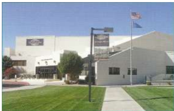
Elko Convention Center (ECC)