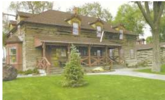
Historic Sherman Station