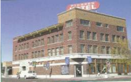
Western Folklife Center